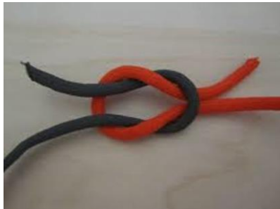
The Reef Knot

KNOTS - Lockdown is a great time to get practising some useful knots. Find some string or rope and get knotting. Challenge yourself to master just three . These are the most useful ones for Forest School: